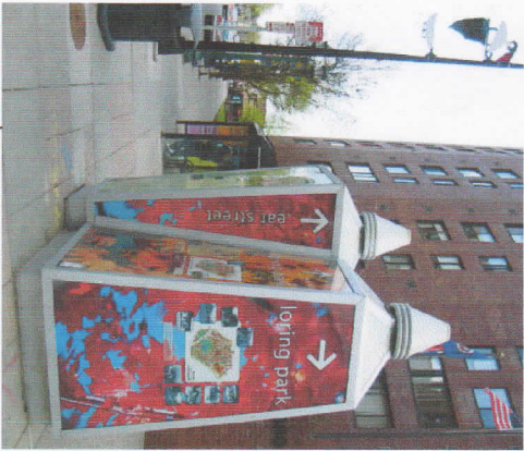
Eat Street Kiosk